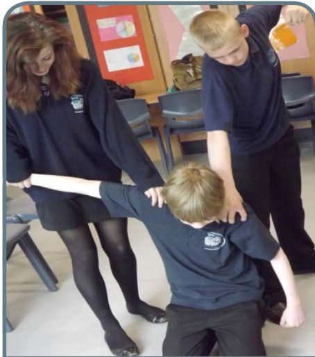
Refugee Voices performance